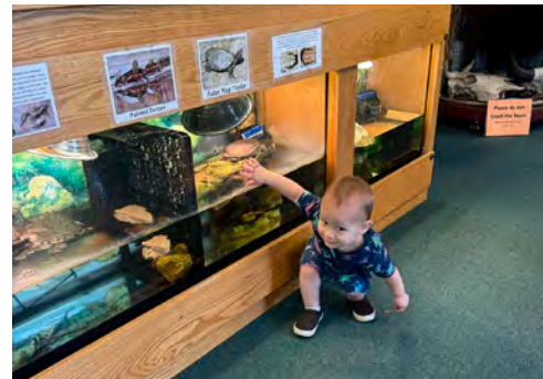
Hey everybody! I found some turtles!