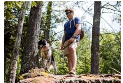
Getting outside is more fun with friends, especially furry, four-legged ones.

Are you wondering where you can enjoy a picnic with your pet at Willow or Kinni? Willow has a great pet-friendly picnic area near the boat launch. Buckthorn Brigade volunteers have worked hard in this area to clear out brush and open up lake views. Kinni has several parking areas near the park office where you and your pet can enjoy a quiet picnic.