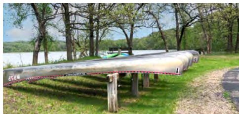
The Friends' boat rental fleet includes both canoes and kayaks.

Looking for a great way to get out and enjoy Willow's Little Falls Lake? How about renting a canoe or kayak from the Friends? You can explore areas of the park