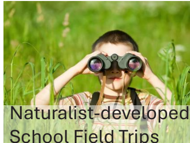
Naturalist-developed School Field Trips