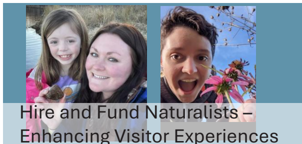
Hire and Fund Naturalists – Enhancing Visitor Experiences