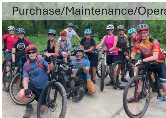
Purchase/Maintenance/Operation of Trail Grooming Equip