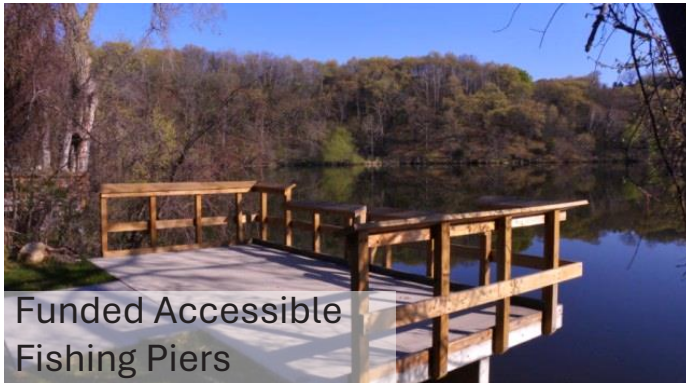
Funded Accessible Fishing Piers