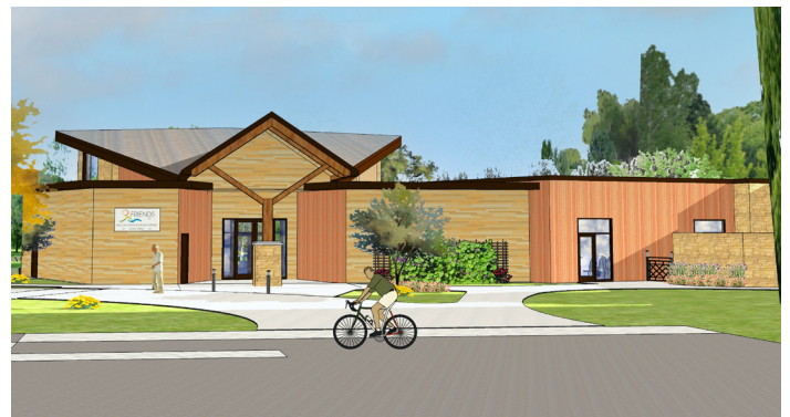
Proposed new nature center conceptual drawing

Thank you to all of the Friends and volunteers who help make our two parks great places to visit. Your help is greatly appreciated. I hope to see you out here soon.