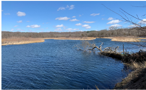
Peaceful Little Falls Lake

Enjoy our parks! Choose your trail and let our paths in nature guide you in more ways than you might ever have realized.