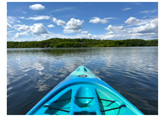
Little Falls Lake