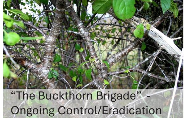
“The Buckthorn Brigade” – Ongoing Control/Eradication