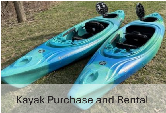
Kayak Purchase and Rental