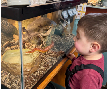
This young visitor was nose to nose with ambassador snake, Clementine.

The nature center is open seven days a week all year round. The Friends accomplishes this by employing two naturalists and engaging willing volunteers to serve as nature center hosts. Thanks to their availability, over 14,500 visitors were hosted at the nature center in 2024. This represents a 20% increase from visits in 2023. Notably, 2023 visits were up 14% from the previous year.