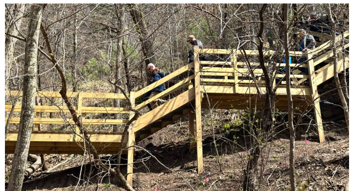
The project to rebuild the stairs at Willow Falls is complete.

Due to budget constraints, we will be operating with fewer summer employees until operational budgets are adjusted. Willow's vacant Park Ranger position has been upgraded to a Park Manager and is expected to be filled by mid-June.