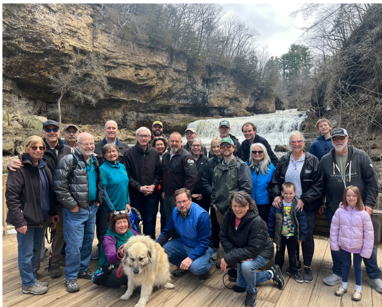
Gov. Evers poses with his hiking companions at Willow Falls.