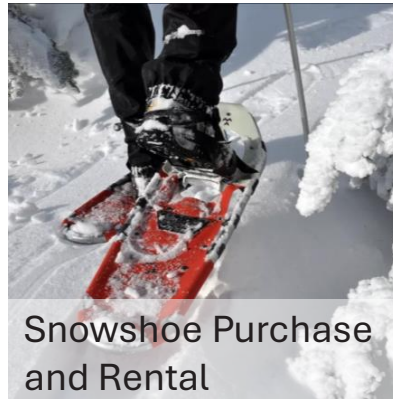
Snowshoe Purchase and Rental