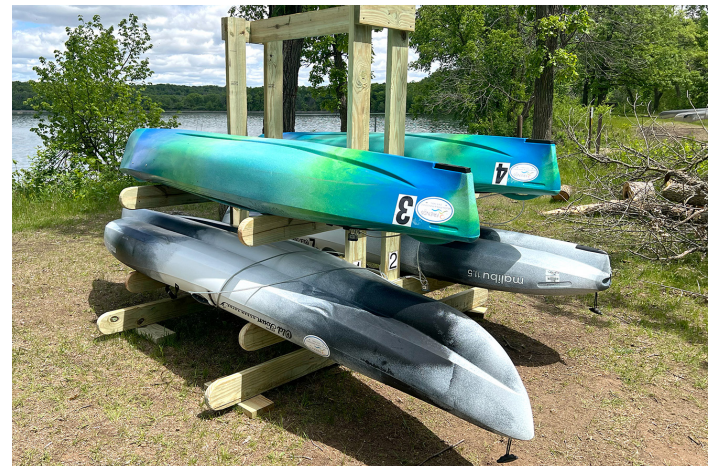
New rental kayaks

The kayak rack is now located where renters can launch without carrying boats across the pavement.